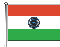
Zaskar River - India August