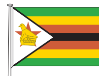
Zambezi River - Zimbabwe September to November